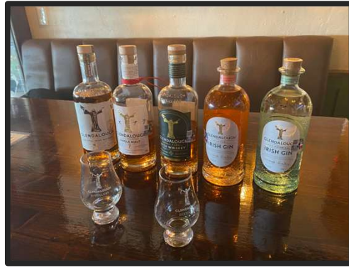
The bottles shown are for illustration purposes only. These may not necessarily be the spirits served at the event.